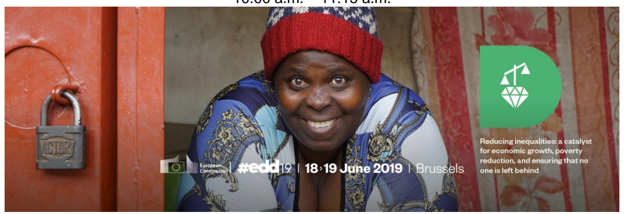
Organized by the Regional Government of Andalucía With the support of the United Nations Development Programme and PLATFORMA

Tuesday, 18 June 2019 Lab debate – D1 10.00 a.m. – 11.15 a.m.